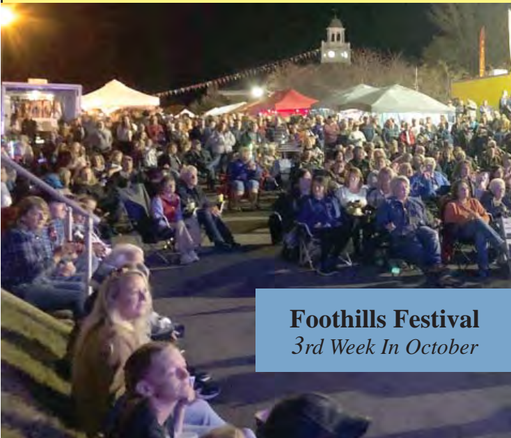
Foothills Festival 3rd Week In October