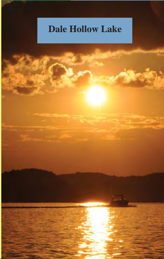
Dale Hollow Lake

Rollercoaster Yard Sale September www.therollercoasteryardsale.com