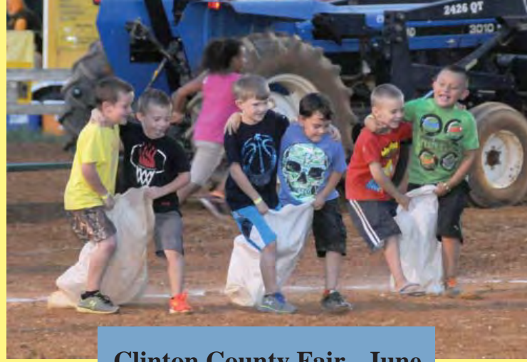
Clinton County Fair - June www.clintoncofair.com